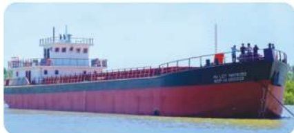
2250 T Coal / Ore Carrier - 5 Nos. Shreeji Shipping, Jamnagar