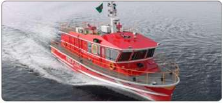
Fire Boats, Khulna Shipyard (Bangladesh Navy)

For Heavy Cargo Barges Heavy Duty Fire Floats