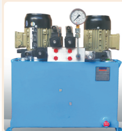
Twin Motor Aluminium Construction Power Pack with IACS recommended Sensors

Automatic Switch over from One motor to other