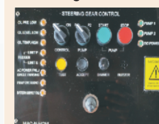
Joystick operated control panel for Twin Motor Electro-Hydraulic Power Pack

Automatic Switch over from One motor to other