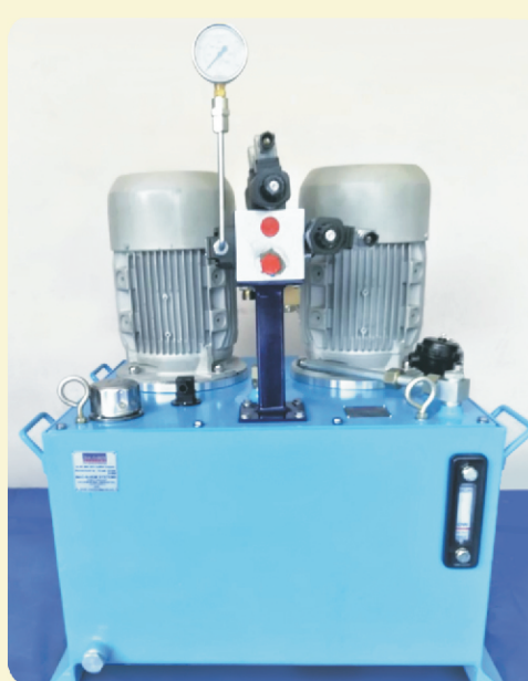
Twin Electric Motor (AC) Type with IACS recommended Sensors