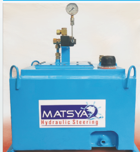
Jacketed Hydraulic Power pack