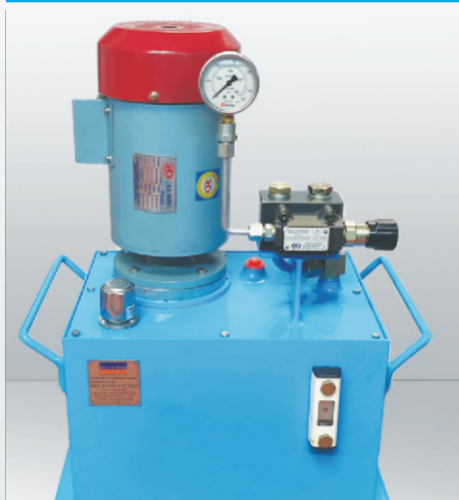
DC (Direct Current) Type Hydraulic Power pack

Automatic Switch over from One motor to other