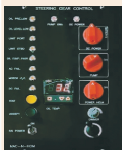
Joystick operated control panel for Single Motor Electro-Hydraulic Power Pack