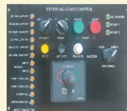
Joystick operated control panel for Twin Motor Electro-Hydraulic Power Pack

Automatic Switch over from One motor to other