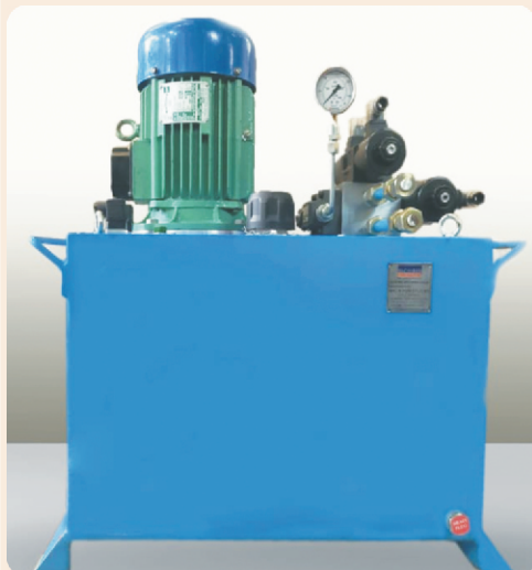
Single Electric Motor (AC) Type with IACS recommended Sensors